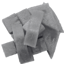
Watermelon 4 cups, cubed

INGREDIENTS Serves: 4 | Serving Size: 1 1/2 cup