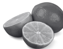
Lime Juice 1/3 cup