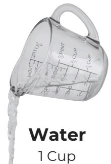
Water 1 Cup