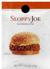
sloppy joe mix 1 tablespoon