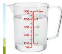
water 1/2 cup