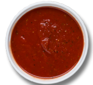
spaghetti sauce 1 cup