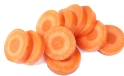
low sodium canned carrots 1/2 cup