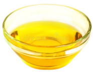
canola oil 1 tablespoon

INGREDIENTS Serves: 6 | Serving Size: 1 bun with 1/2 cup sloppy joe filling