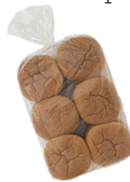
whole wheat hamburger buns pack of 6