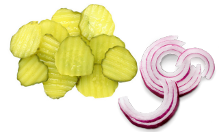
pickles and onions to top (optional)