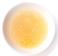
low sodium chicken broth 1 - 14 oz can