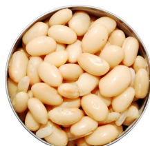
great northern beans 1 - 15 oz can, drained & rinsed