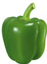
green bell pepper 1 small, diced