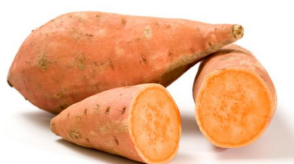
sweet potatoes 3-4 small, diced

INGREDIENTS Serves: 6 | Serving Size: 1/6 of pan