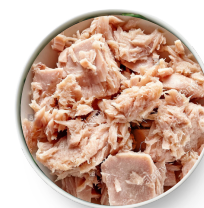
chicken in water, drained 1 - 12.5 oz can