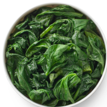
canned spinach 1 - 15 oz can, drained