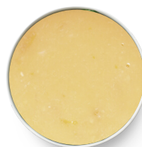
low sodium cream of chicken soup 1 - 10 oz can