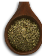
Italian seasoning 1 teaspoon