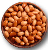
no salt added pinto beans 1 - 15 oz can, drained

INGREDIENTS Serves: 7 | Serving Size: 1 slice