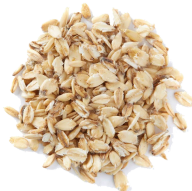
quick rolled oats 2 cups