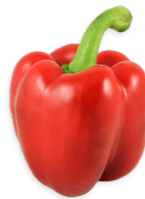
red bell pepper 1 medium