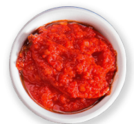
spaghetti sauce 1 - 15 oz can