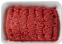
lean ground beef or turkey 1 pound