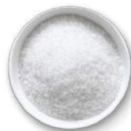
salt 1/2 teaspoon