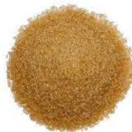
brown sugar 1/4 cup