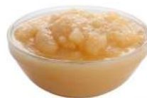
applesauce 1/2 cup