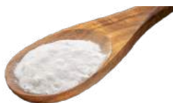
baking powder 2 teaspoons