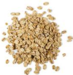
rolled oats 3 cups

INGREDIENTS Serves: 6 | Serving Size: 1/6 of dish