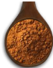
cinnamon 1 teaspoon