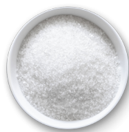
sugar 1 tablespoon