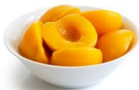
peaches canned in 100% juice 1 - 15.25 oz can, drained

INGREDIENTS Serves: 4 | Serving Size: 1 crisp