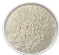
flour 2 tablespoons