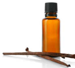
vanilla extract 1/2 teaspoon