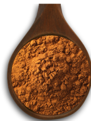
cinnamon 1/2 teaspoon, divided