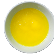
melted butter 1 tablespoon