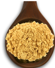
ground ginger 1/4 teaspoon