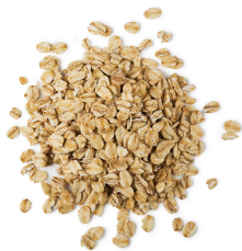
rolled oats 1/2 cup