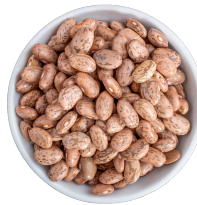
low sodium pinto beans