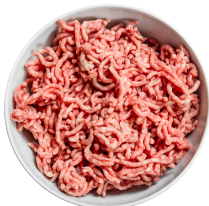
lean ground turkey